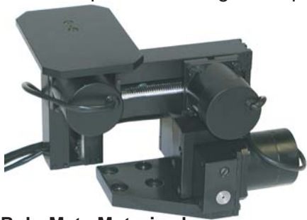
Fig. 3 - RoboMate Motorized XYZ Platform

The RoboMate joystick controls both the direction and the velocity of movement. The target sample under study is placed on the (optional) motorized X,Y,Z platform (Fig. 3), which is then positioned within the working angular coordinates of RoboMate using a second joystick. Once in position the probe/tool of RoboMate can be brought to the target. A combination of movement of the motorized platform and RoboMate enables an unlimited number of positions of the probe/tool with respect to the target sample.