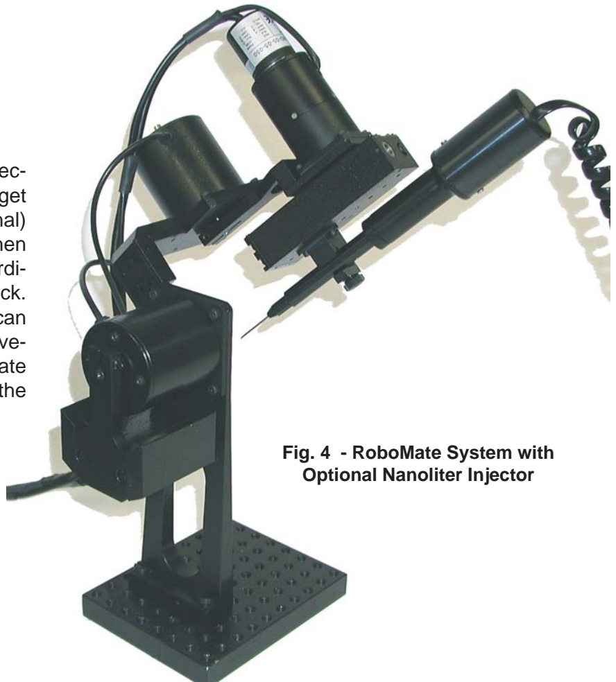
Fig. 4 - RoboMate System with Optional Nanoliter Injector

Software control over the movement of RoboMate can also be achieved using a Windows 2000/XP based GUI.