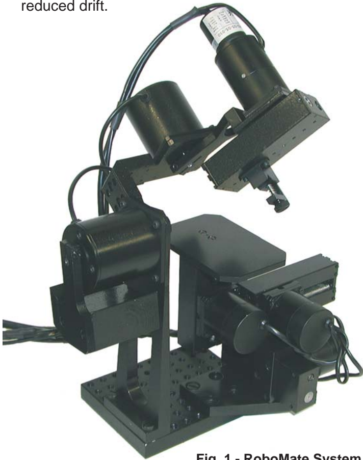
Fig. 1 - RoboMate System (including motorized XYZ platform)

For over 100 years the basic design principle used in standard micropositioner and micromanipulator systems has remained relatively unchanged based on the traditional X,Y and X,Y,Z linear displacement configurations; whereby each axis of linear movement is fixed and perpendicular with respect to an orthogonal axis of linear movement. Whilst a number of technological advances have been made in micropositioner design; such improvements have generally focused on the mechanics and control systems to (for example) provide increased accuracy, better resolution, increased stability and reduced drift.